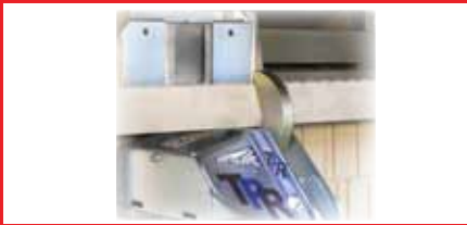
TPR™ is wall mounted away from dirt and debris on drive.