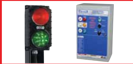
Controls are easily combined with dock leveler controls to integrate entire dock system.