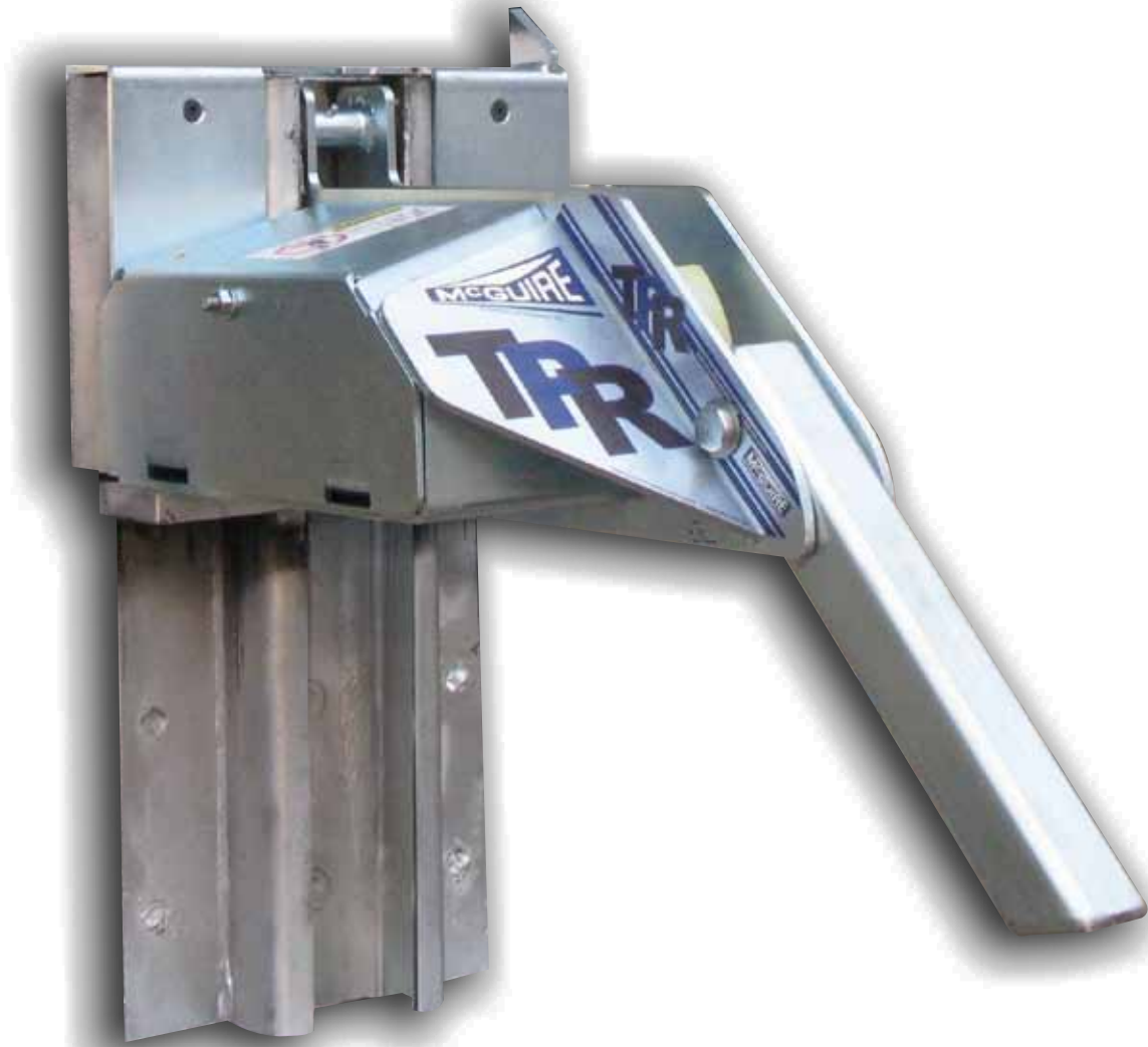
* TPR™ shown in stored position