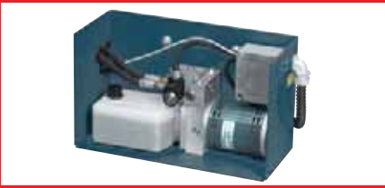
STOP-TITE® self contained motor/pump can be remote mounted.