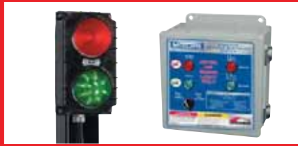
Optional LED light package and standard push button control panel with instructional decal for additional communication safety.