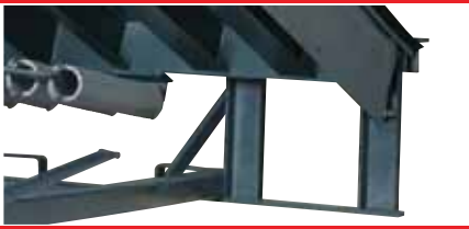
Full width rear hinge in compression with structural channel rear frame supports.