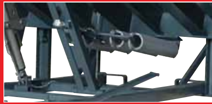
One point adjustable main spring assembly with roller and cam construction.