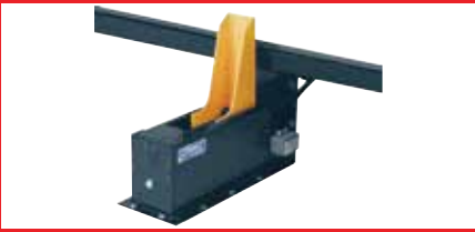
HOLD-TITE® can be drive mounted or wall mounted.