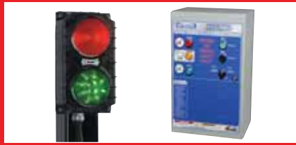
Controls are easily combined with dock leveler controls to integrate entire dock system.