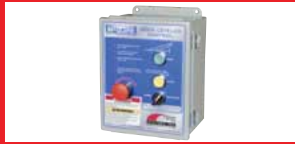
Optional full control panel with raise, lip out, emergency stop, and ARTD feature shown.