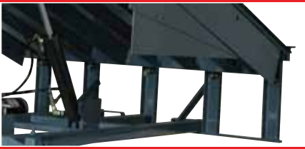
Full width rear hinge in compression with structural channel rear frame supports.